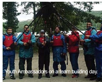
Youth Ambassadors on a team building day.